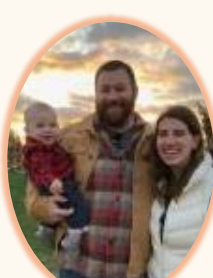
the Watza family