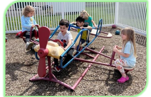
4s on the playground