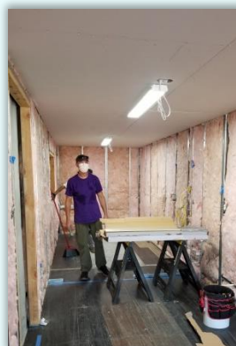
The lights are on!